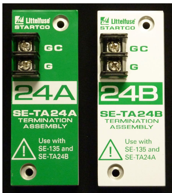
Figure 3: SE-TA24A and SE-TA24B Termination Assemblies