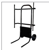
AC6000-MNT-00 Mounting Frame Optional for mounting ISB to a cart or other surface. Included with the AC6000-CART-00.