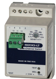
PC-102 Dual-Channel Switch Seal-Leak Detection Relay