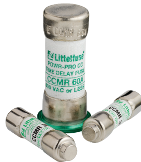
Class CC Fuses