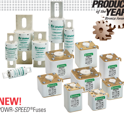
NEW! POWR-SPEED® Fuses