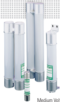
Medium Voltage Fuses