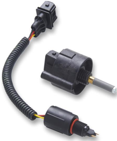
Figure 1: Water in Fuel Sensor