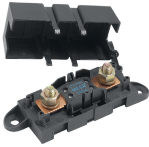
02980900S Fuse not included