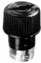
585 Cap SLOTTED TOP FOR 5x20MM FUSE