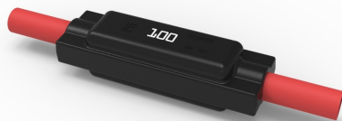
Cable Fuses - CablePro®