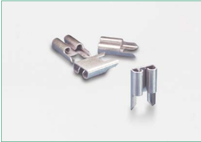
Dimensions in mm / Maße in mm